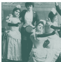
DENVER WOMEN INVEST

FEB 20TH | 6PM | CARBON ON PLATTE | HOME + INVESTMENT LOANS